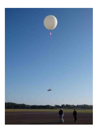
Fig. 2. Typical flight altitude and duration of a sounding balloon.